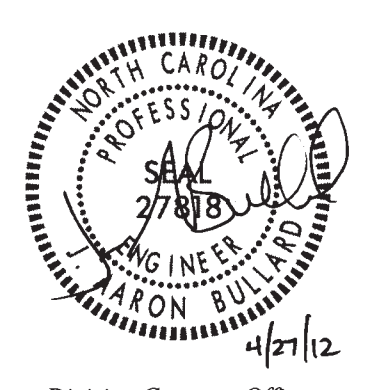
Division Contract Officer

A bid bond is not required for this Contract.